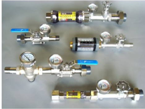
Evans Integrated Pressure / Temperature Gauge "Bi-Dicator" 0-100psig / 0-140° F